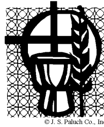
© J. S. Paluch Co., Inc.